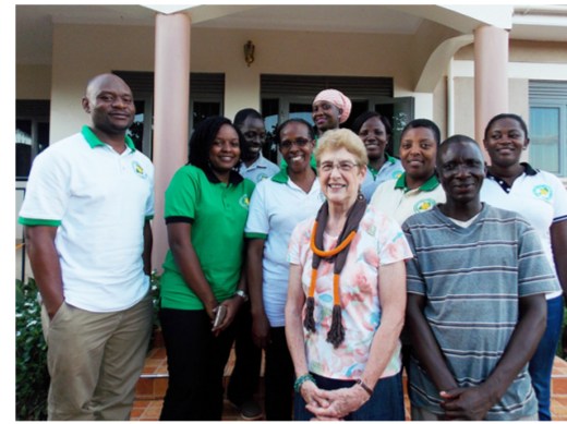
With the PCAU staff