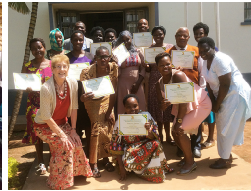
With palliative care scholarship recipients