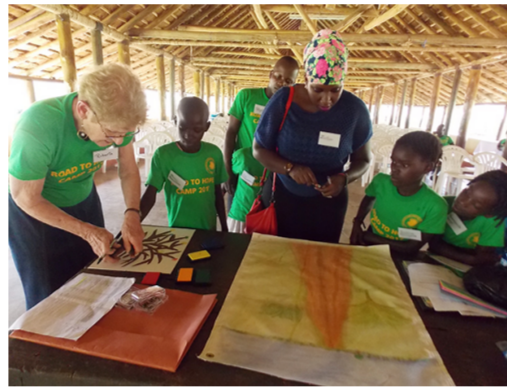
With the Road to Hope children