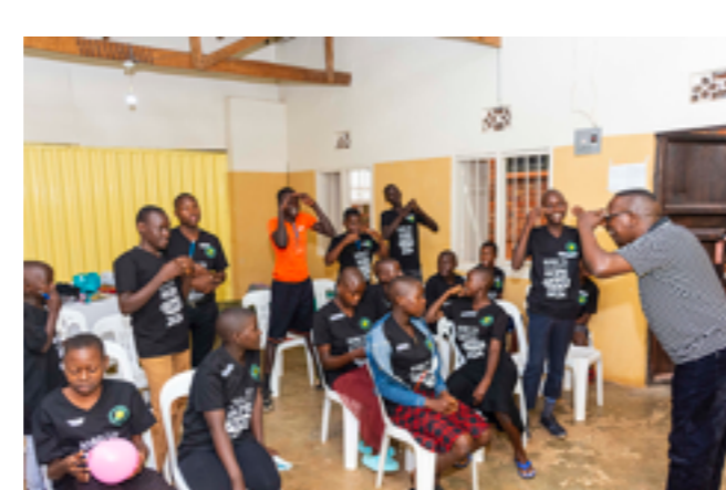
Road to Hope Camp 2024