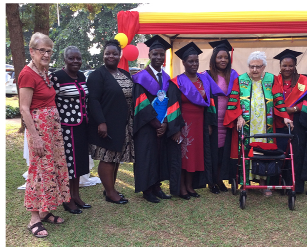
Attending the ADCPC student graduation