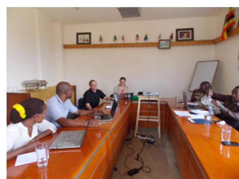
mHealth project project planning meeting

The CHC/PCAU partnership continues to evolve, aligning its efforts with PCAU's strategic plan and priorities . From providing guidance on strategic planning, to supporting initiatives such as the mHealth Project , to facilitating student internships , the partnership engages local communities and other partners such as the University of Notre Dame.