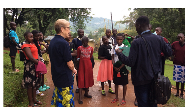
Participating in the Road to Hope Camp